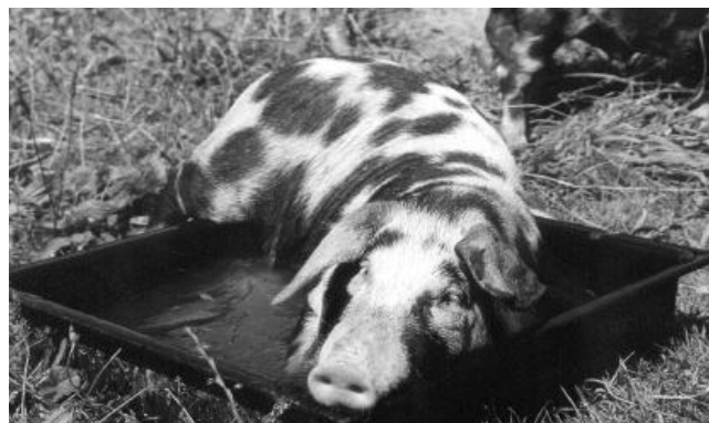
Turopolje pigs are, due to their original living space in the Save-Auen, excellent swimmers.