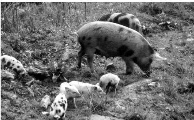
The animals search for their food as far as possible.