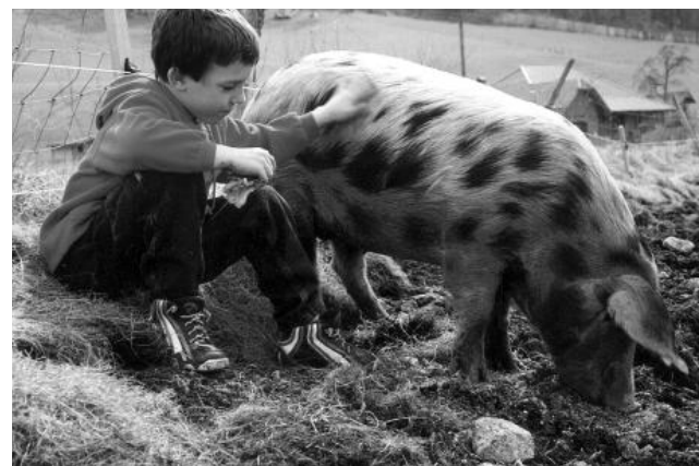
Breeding young with Turopolje pig